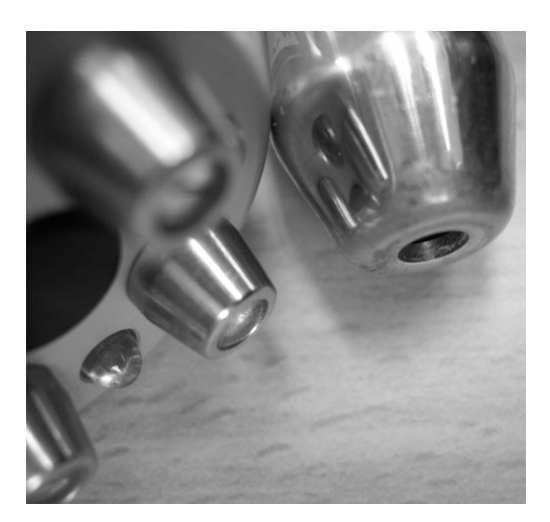
FIG. 3. Laser probe tip, the 904 nm laser with a protruding lens ( left ), and the 810 nm laser with a folded up lens ( right ).

contact than with no skin contact. On the other hand, the 810 nm laser probe has a recessed flat window. Here, the metallic ring surrounding the lens will push skin underneath the lens, which leads to less penetration with the probe in skin contact than not in skin contact (Fig. 3).