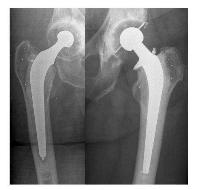
Figure 3. The Charnley flanged 40 (left) and the Spectron EF (right), with tantalum markers. (The different bearings with the Spectron EF stem are radiographically identical.)

were allowed partial weight bearing with crutches from the 1st post-operative day. Restrictions were discontinued 6 weeks post-operatively.