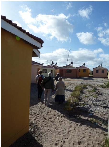
(Witsand, field visit 29.09.2011: myself [left] and other researchers on a site briefing with WEHBSO.)