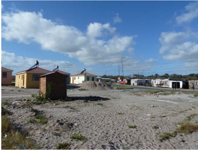
(Witsand, field visit 29.09.2011: informal dwellings to the right, formal housing on the left.)

project implementation, it cannot be assumed that Witsand was a cohesive “community” unified by shared experiences.