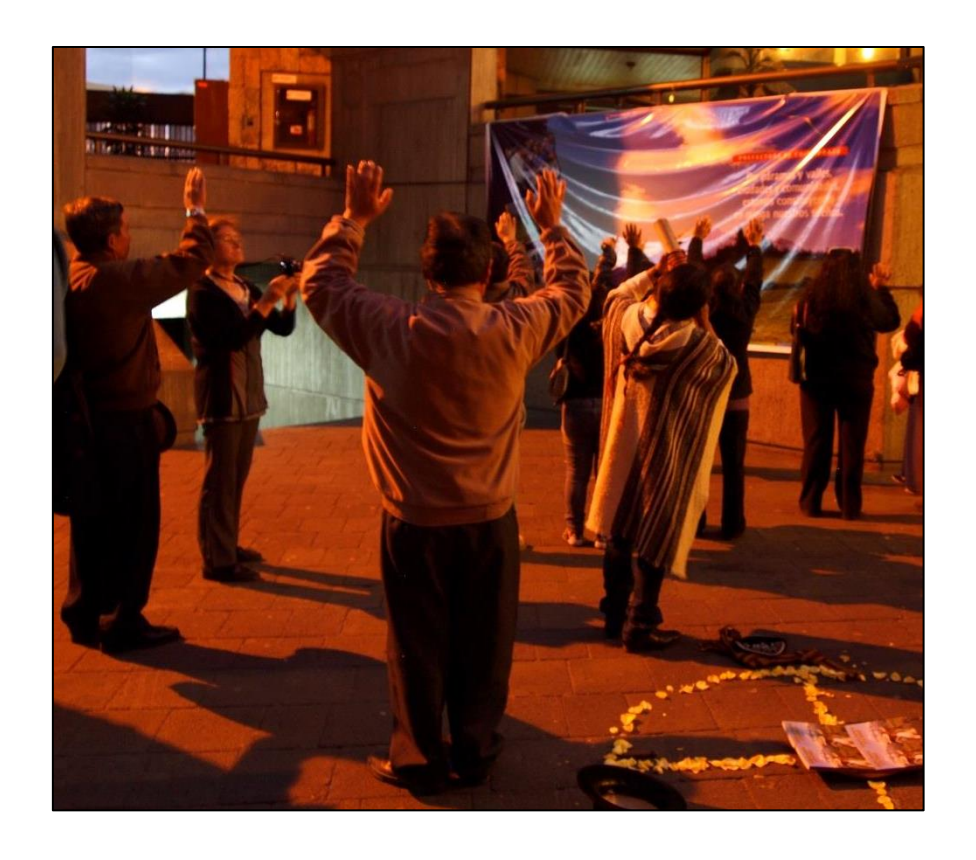
Picture: From the opening ceremony at the book launch of "Sabiduría Ancestral de los Yachaks" (2013)