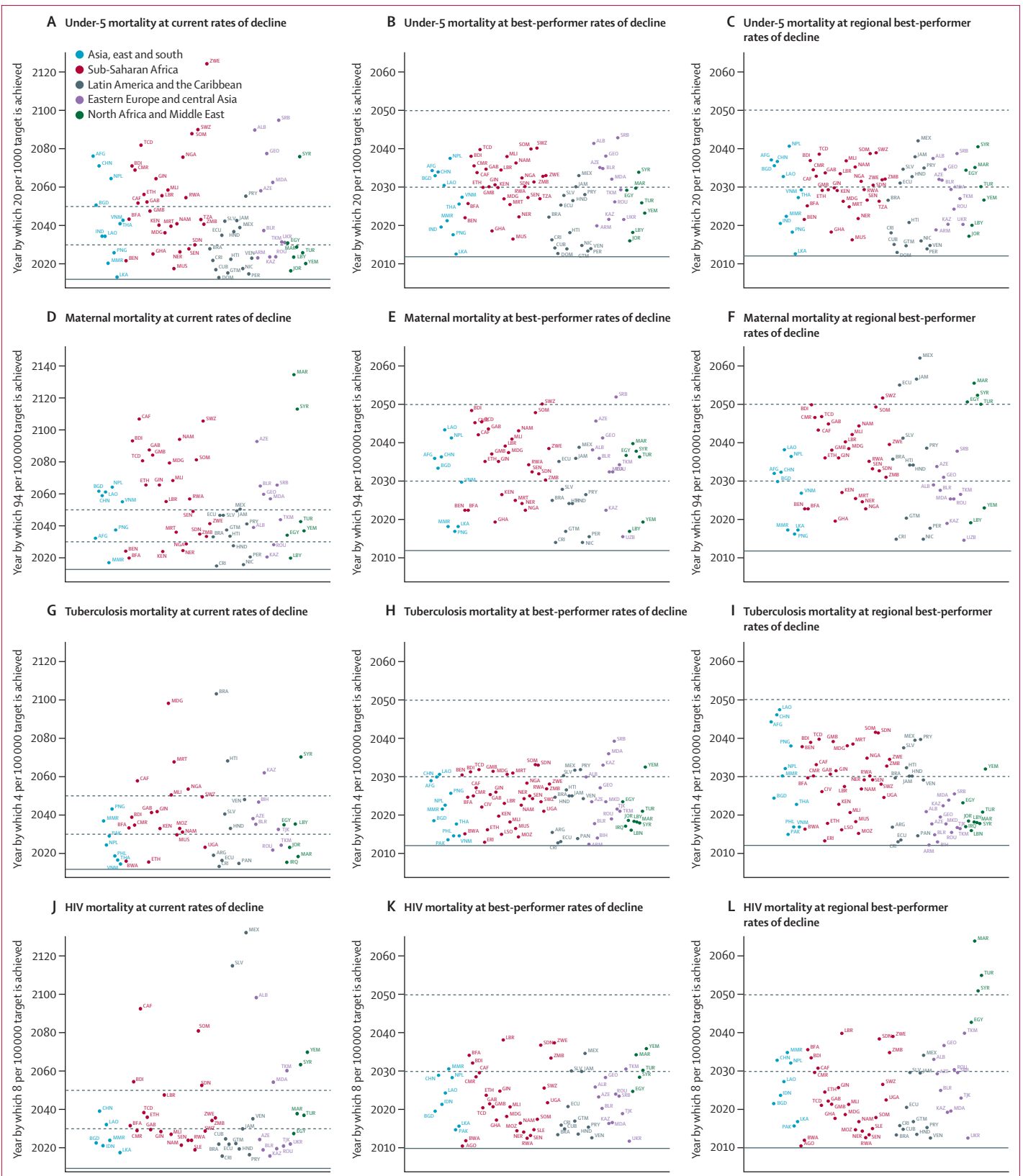
Figure 3: Year by which The Lancet's Commission on Investing in Health targets could be achieved

Grey line represents 2012 for under-5 and tuberculosis mortality, 2013 for maternal mortality, and 2010 for HIV mortality. Dotted lines are at 2030 and 2050. Regions and country codes are defined in the appendix (p 1).