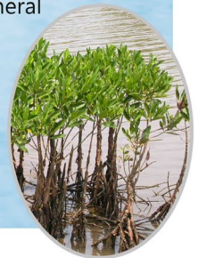
FIGURE 1 Conceptual representation of the principal causes of loss of genetic diversity in the marine environment, including relevant examples from around the world.