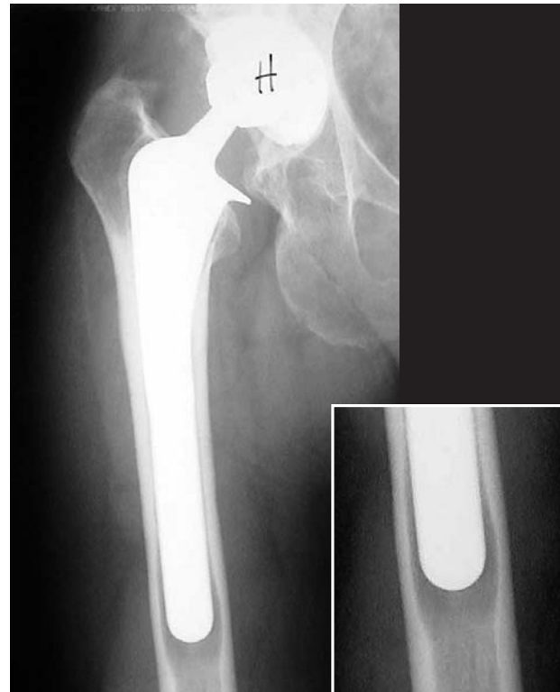
Figure 3. Harris-Galante stem showing moderate distal osteolysis. Radiographically, the stem is otherwise well fixed.