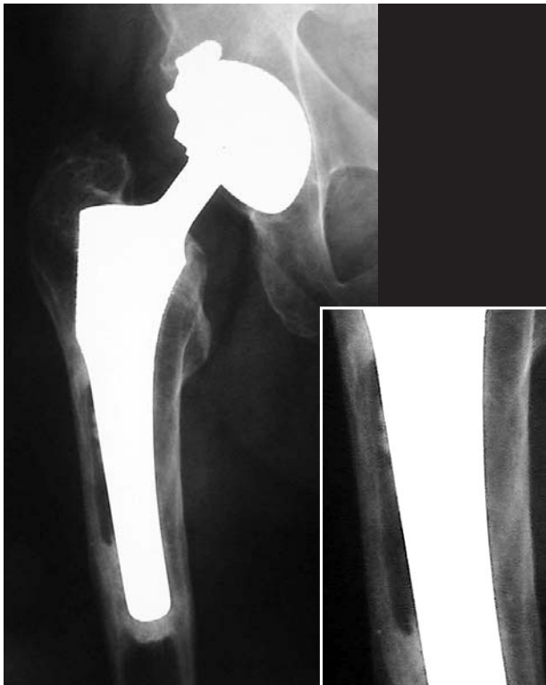
Figure 2. PCA with distal osteolysis. The patient had clinical signs of aseptic stem loosening, starting several years before the osteolytic lesion developed.