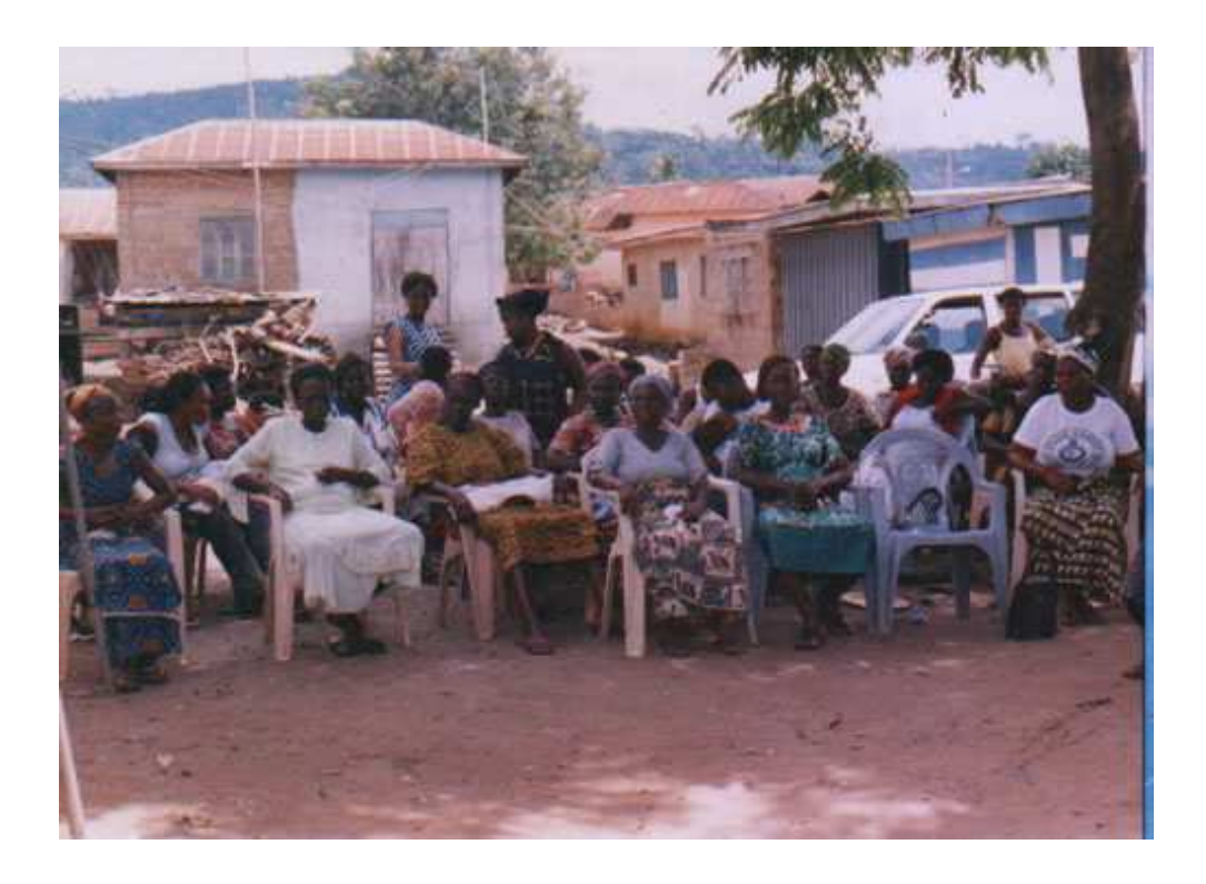
FIDA / Legal Aid Collaboration: mobile outreach clinic in Oyoko (Koforidua)<sup>46</sup>