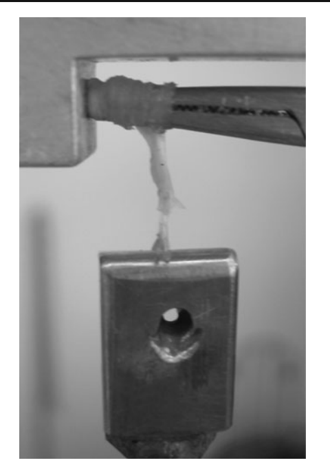
Fig. 4 A rat Achilles tendon at the moment of rupture during UTS testing

significant (p < 0.05) in the active LLLT group (Table 1), but was not significant the placebo LLLT group (p=0.16; Table 1). The mean transverse thickness of the injured right Achilles tendon was 0.70\pm0.10 mm in the active LLLT group and 0.63\pm0.14 mm in the placebo LLLT group. The mean thickness of the healthy left Achilles tendon in the two groups was 0.51\pm0.07 mm and 0.57\pm0.07 mm, respectively.