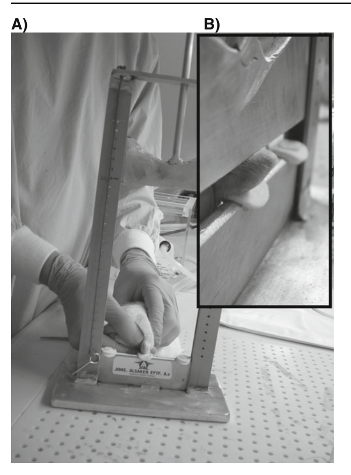
Fig. 1 a Mini guillotine with rat positioned for Achilles injury. b ( insert ) Close-up of the tendon crush location

The deformation rate was 0.25 mm/s. The load and deformation data were sampled continuously during the test.