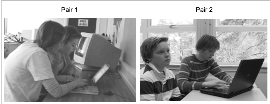
Figure 3: Still shots from the work segments of pair 1 and pair 2

Pair 2, on the right picture in Figure 3, shows a quite different type of co-work. Two pupils sit as far apart as possible within the limits of still calling it pair work. One pupil controls the keyboard and the mouse and, when the computer is portable, quite often moves the computer closer to himself. The other stares into space and twists his fingers. Every now and then the pupil who controls the computer turns it over to his partner. This is an exchange of roles which often occurs when a task is finished or a problem has proven to be too difficult to be solved alone. The computer is moved back and forth. It looks like individual work in a pair. These observations of pair 1 and 2 are in line with the findings of Underwood and Underwood (1998) and Sanders (2006): The girls collaborate; they work together on all parts of the problem. The boys cooperate; they divide the work between themselves.