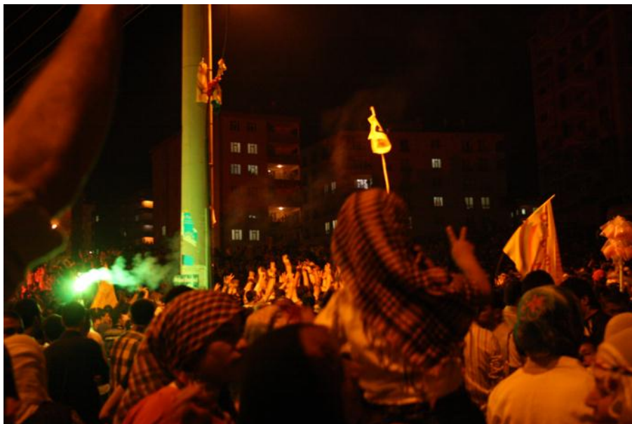
Figure 10: Crowd of BDP-supporters celebrating around the BDP's main office

The dancing should here be interpreted as a joyful celebration, and not as any kind of provocation. My informants, who had been more relaxed during my 2011 stay than during my fieldwork had to readjust their expectations of police interaction again as the political situation had become tenuous.