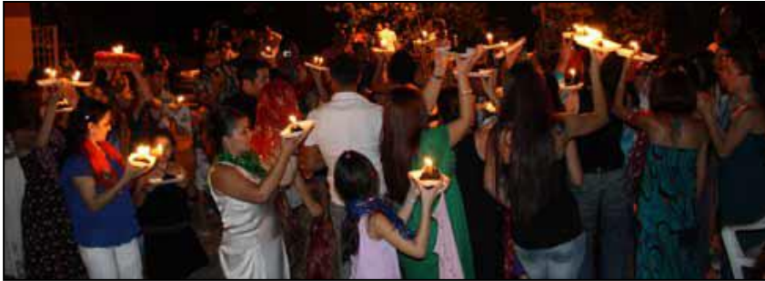
Figure 5: Female friends and relatives walk around the bride and groom with the henna, before it is used to decorate their hands.

bride to the wedding. At several occasions the groom's family must ritually pay the bride and her family members in order to bring her with them. At this time the bride's family is expected to be grieving the loss of their daughter or sister. While the bride's grieving father is absent, the bride's brother or other close male relative is responsible of giving the bride to the jubilant family of the groom. After the couple has been bestowed with gifts, and the dinner has been served, the couple is wed by an Imam. At last the marriage is consummated (Karakeçili 2008).