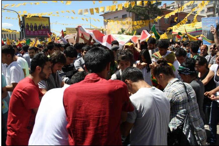
Figure 8: Dancing at an election campaign meeting in Diyarbakir in 2011.

In this chapter I will discuss the role of Kurdish folk dances in political contexts like concerts, the calendrical celebration Newroz, and political meetings and demonstrations. I will look at how the body is used in protest, and how the ideal of self-sacrifice and commitment is embodied through dance, and how the dancing games provide the experience of communitas . While the dancing games in ceremonial contexts emphasize status and social relations, the dancing games in political contexts trivializes such social relations for the benefit of Kurdish union; the only relation that matters in this context is the belonging to or sympathy towards the Kurdish struggle.