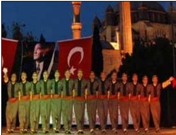
Figure 7: Kurdish folk dances performed with Turkish flags and a picture of Atatürk in the background.

the Kurdish language – especially words containing letters which do not appear in the Turkish alphabet, like x, w, and q – Kurdish names for dances like Gowend is known as Güvend .