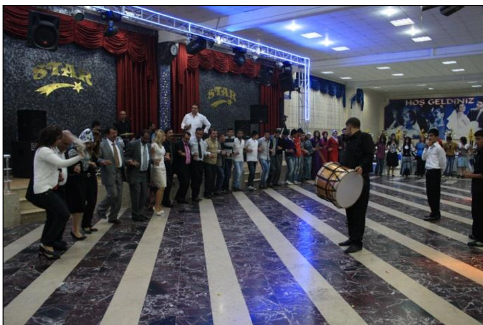
Figure 4: Dancing at Kurdish wedding in Diyarbakir

Kurdish dances as embodied ‘connectivity’