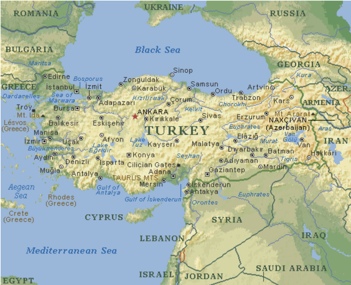
Figure 1: Map over the Republic of Turkey