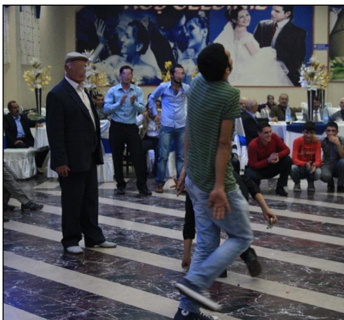
Figure 6: Two generations of solo dancers in a Kurdish wedding.

That my informant said that ağır adamlar are 'ashamed to dance' should be translated as that they avoid doing anything that they could be ashamed about, because they are concerned with their own social standing. Ağır adamlar are described as serious and respectable individuals that act slowly and controlled, and in my understanding, they are individuals that often have – or want to express – a relative high status and authority, and the ability to behave accordingly.