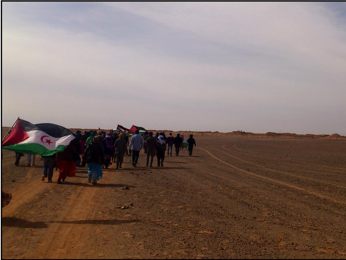
Sahrawis marching to the berm, which can be seen at the end of the picture.