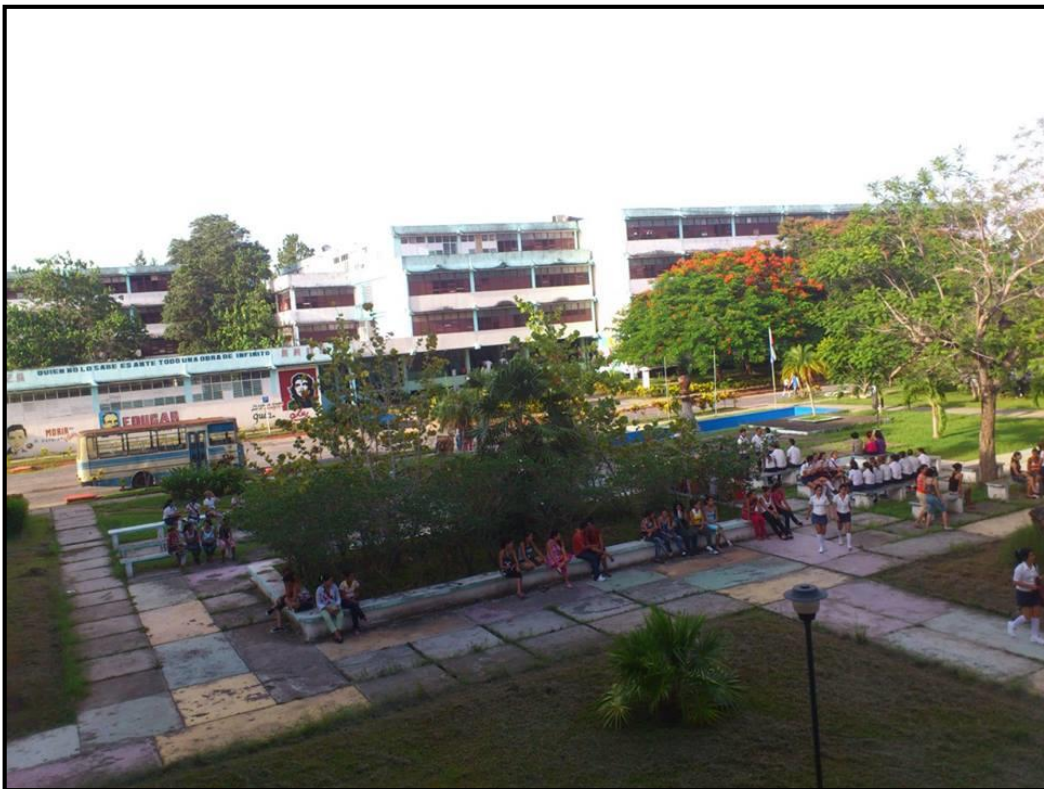
The course starts at the Faculty of Education of Pinar del Río. Photo by the author (2013)