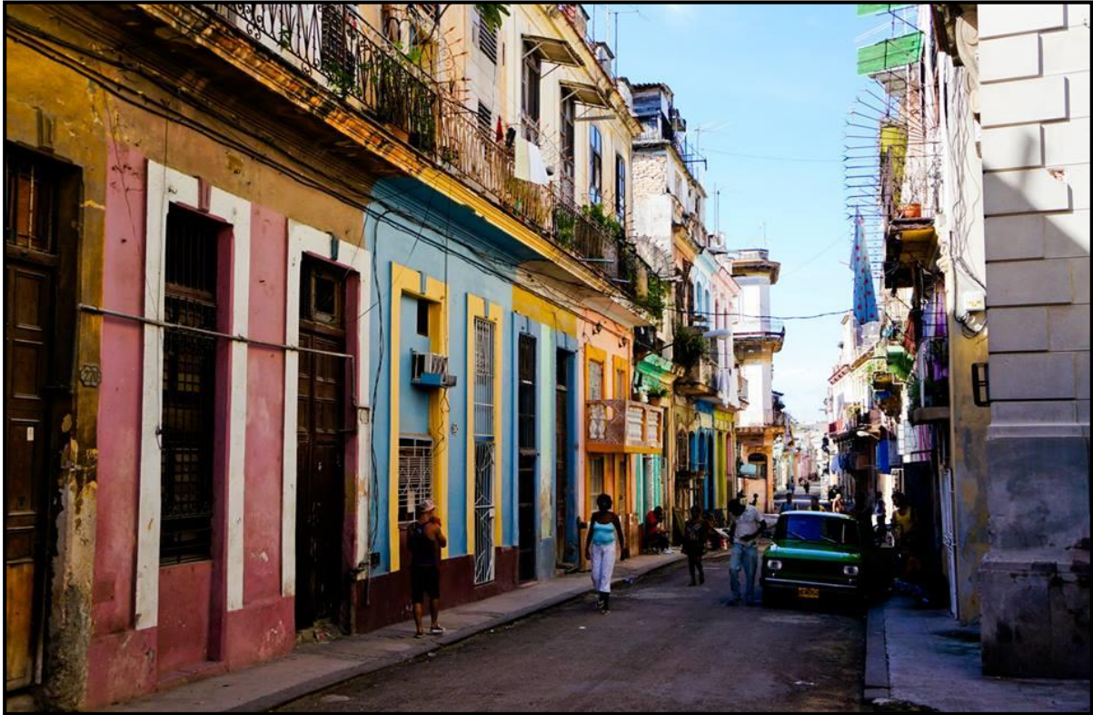
Typical Cuban street. Havana.

“Now that you have seen a bit around Cuba, what do you think about the buildings? And the cars?” was the first questions I got from a Technology Sciences student, talking about one of his first shocks when arriving to Cuba. He was comparing the island with Spain, where he had been every summer as a kid.