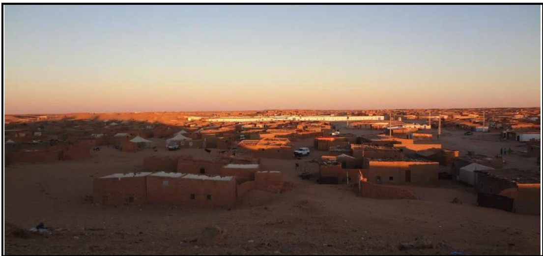
Detail of the refugee camp of Boujdour.

After the Spanish colonizers left Western Sahara by 1975 with a failed process of decolonization, Morocco began an illegal occupation of the country that has lasted to this day (Smith 2005:546). A large number of Sahrawi fled then from the occupiers, either to Mauritania or towards the only other possible direction: the desert. But the majority could not escape, staying in their territory, now illegally occupied by Morocco (Smith 2005:547). Algeria, a declared official 'enemy' of Morocco, offered refuge on a small desert part of their territory, in Tindouf, to those who could escape (Zoubir and Benabdallah-Gambier 2004:59).