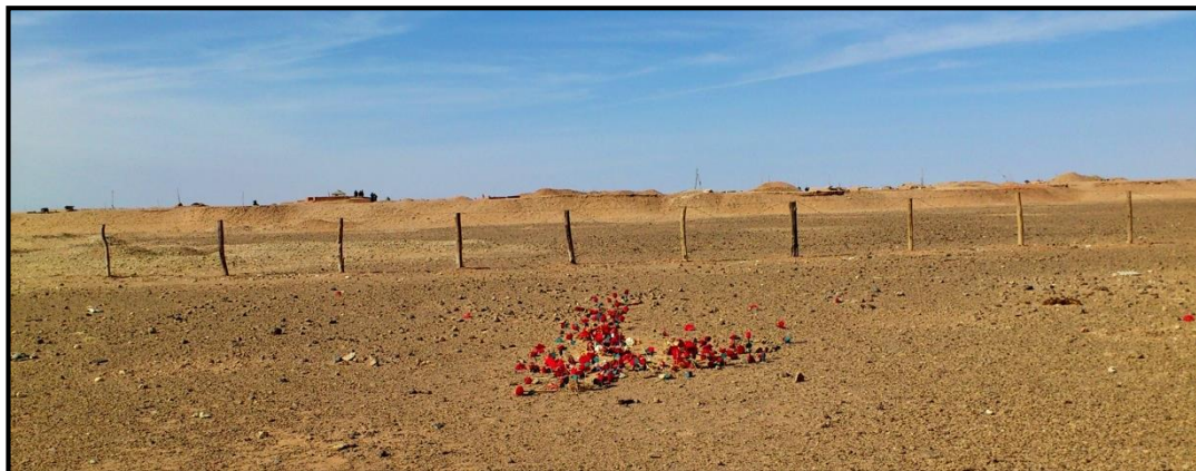
Detail of the Moroccan wall. As part of an art project ('A flower for each mine'), red flowers can be seen throughout the berm. In the back, Moroccan soldiers guard the fort while keeping an eye on 'the visitors'. Photo taken by the author (2013)