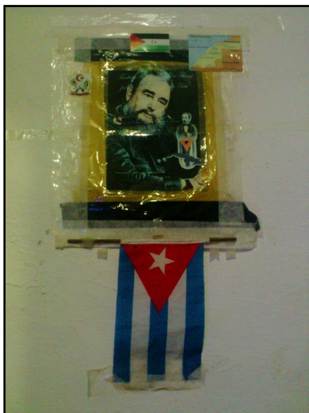
Detail on the wall of the Cubarawi host of the party.