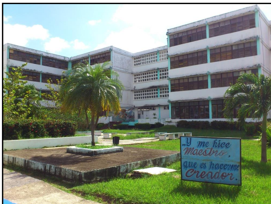
Detail of one of the student residences in Pinar del Río. The sign says "and I became a teacher, thus becoming a creator", sentence by José Martí.