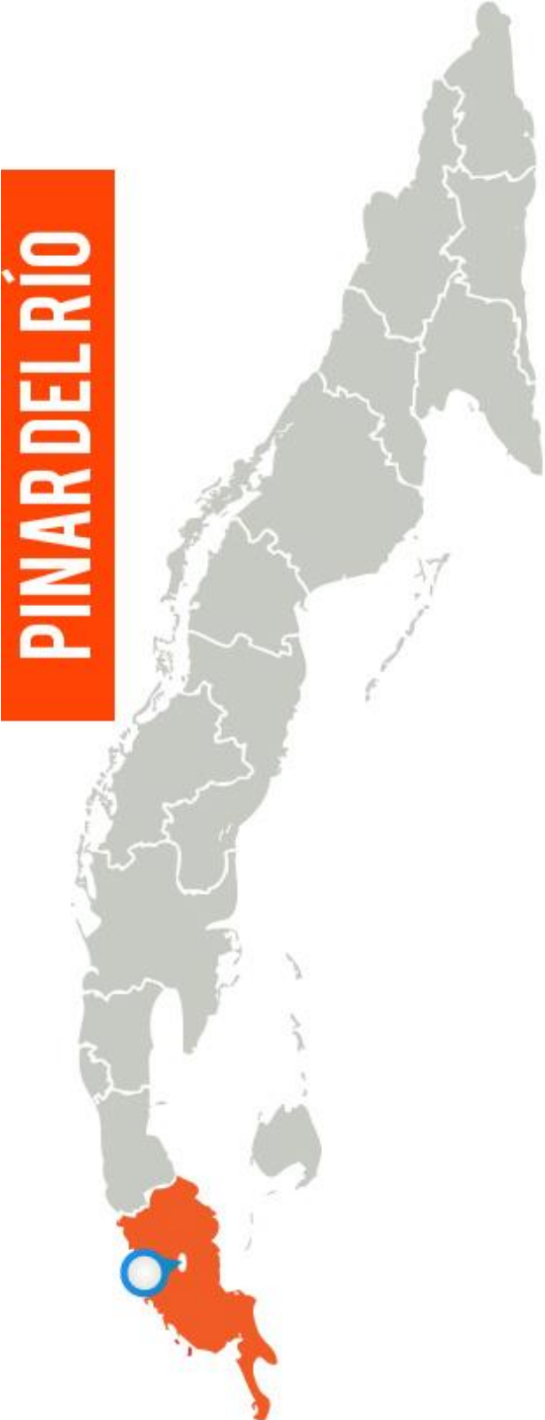
Map from the Cuban Tourist information in Mexico, 2013