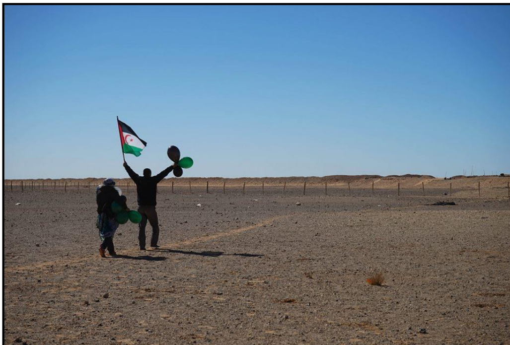
Two Sahrawis approach the berm with a Sahrawi flag and balloons with the colors of this flag, during one of the marches to the berm.

intention was not to be shot by the Moroccan army, but to make them nervous and on guard every time the Sahrawis were in front of them.