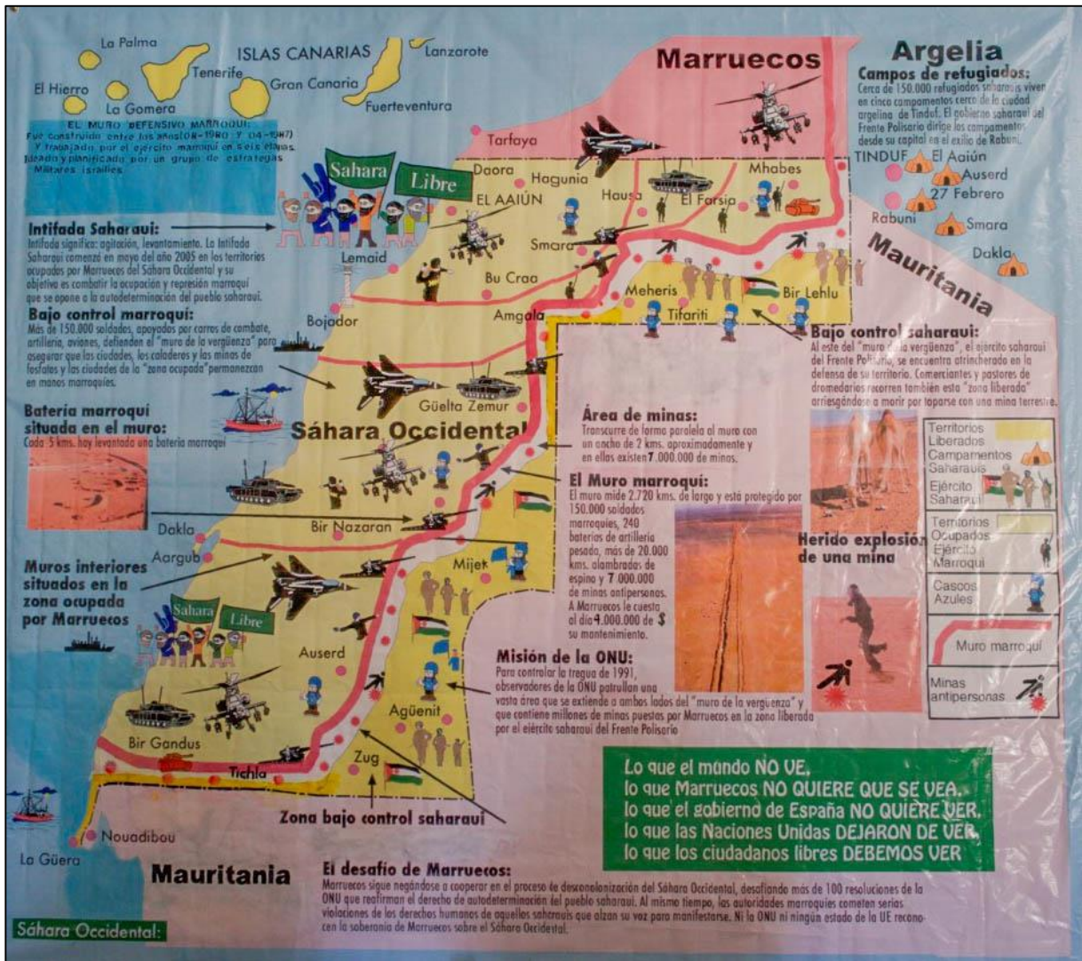
Historical graphic description of the Sahrawi/Moroccan conflict from the War Museum in the wilaya Rabouni, at the refugee camps in Tindouf (Algeria). Inside the green box it says: «What the world DOES NOT SEE, what Morocco DOES NOT WANT TO BE SEEN, what the government of Spain DOES NOT WANT TO SEE, what the United Nations STOPPED SEEING, what a free citizen MUST SEE».