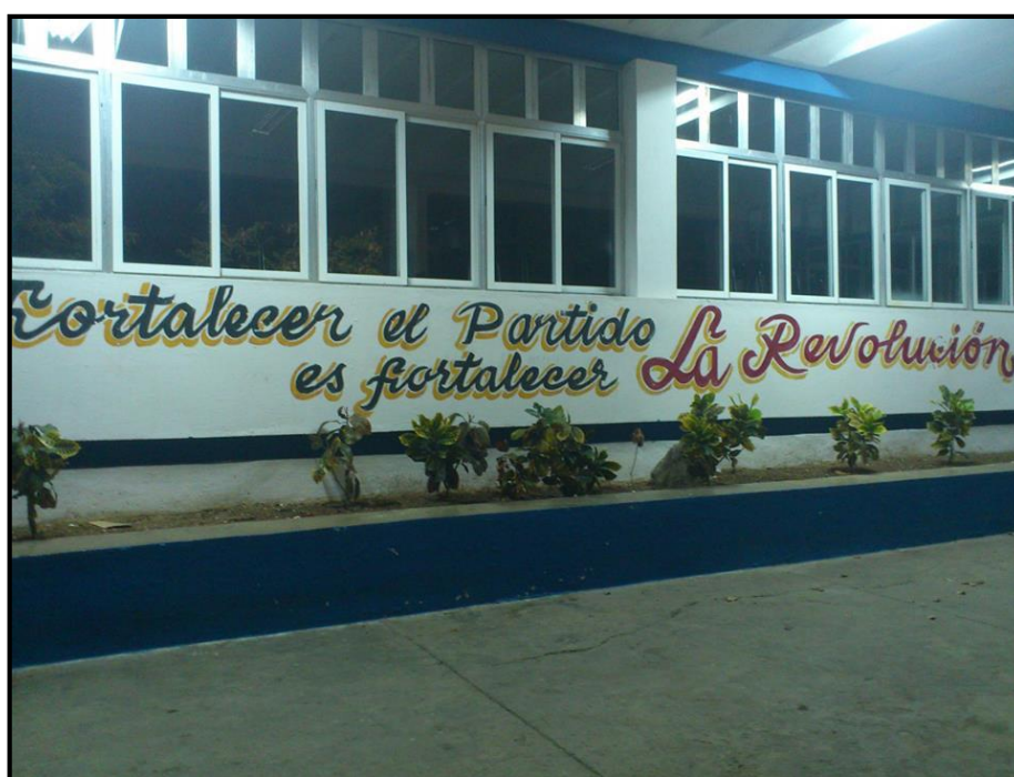
One of the walls at the Faculty of Medicine in Pinar del Río. The message says ““Strengthening the party means strengthening the Revolution. Photo by the author (2013)

Announcing a new plan to improve the quality of teaching at the universities, the former Cuban Minister of Higher Education, Miguel Díaz-Canel said in 2009 that the priority of the university is “to achieve a greater political and ideological preparation and to perfect the educational teaching process”, in order to warrant universities “for the revolutionaries” (La Gente, Radio La Primerísima, 2009). Following those words, the former Minister added that they would achieve this by “shaking the classrooms with a deep and systematic political and ideological work”, being rigorous in the entry of new students into the university, as well as in the selection of faculty staff. “Academic criteria, revolutionary attitudes and social compromise will prevail”, he determined.