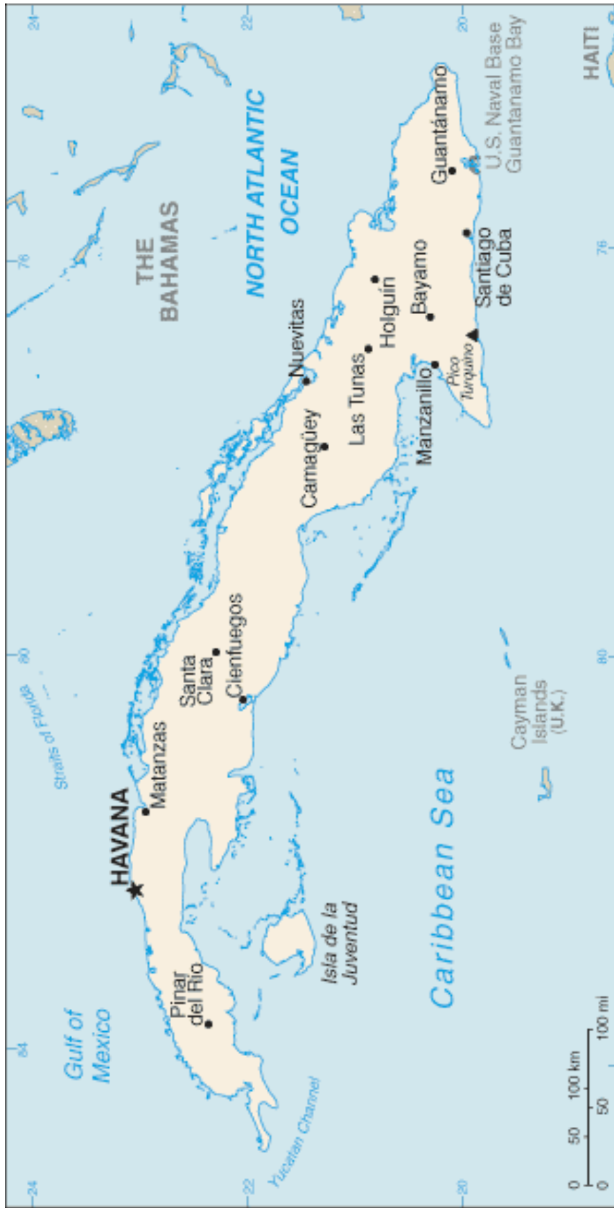
Map from the United States Central Intelligence Agency - CIA World Factbook: Cuba.