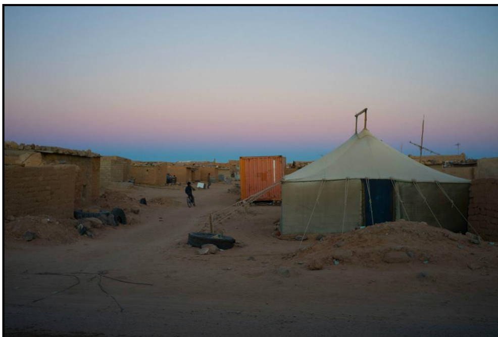
Typical street in the wilaya 27 th February (later Boujdour), where I stayed. On the right, one can see a haima ; on the left, adobe houses.

sofas in the living-room, although sometimes the night temperature on that room would be too cold for Hadiya and she would then sleep on the floor in the sleeping-room. The bathroom was a small adobe room outside the main building. In this one there was a hole in the floor, a washing-machine that did not work but was used as a laundry basket, a small stove to warm the water up and a mirror. Hadiya's plot was also comprised by her sister's and her mother's houses, even if they were not living there anymore. That made the place look more spacious.