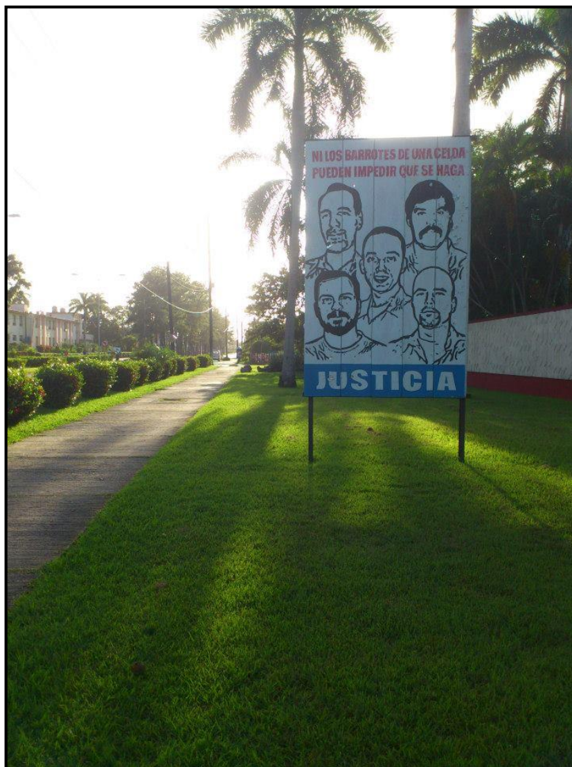
One of the posters of Los Cinco in the main street in Pinar del Río. The poster says “not even the bars of a cell can prevent justice being done”.

I'm comin' home, I've done my time Now I've got to know what is and isn't mine If you received my letter telling you I'd soon be free Then you'll know just what to do If you still want me