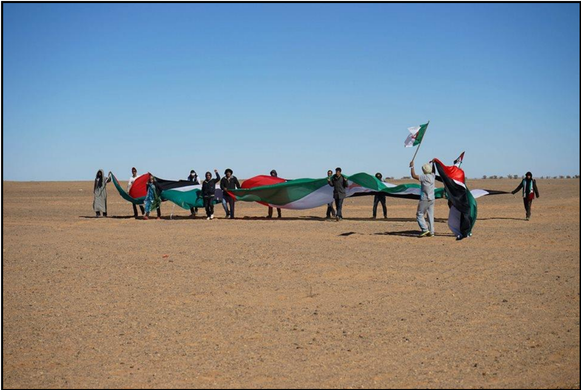
Young Sahrawis in active waithood. March to the berm in January 2014.