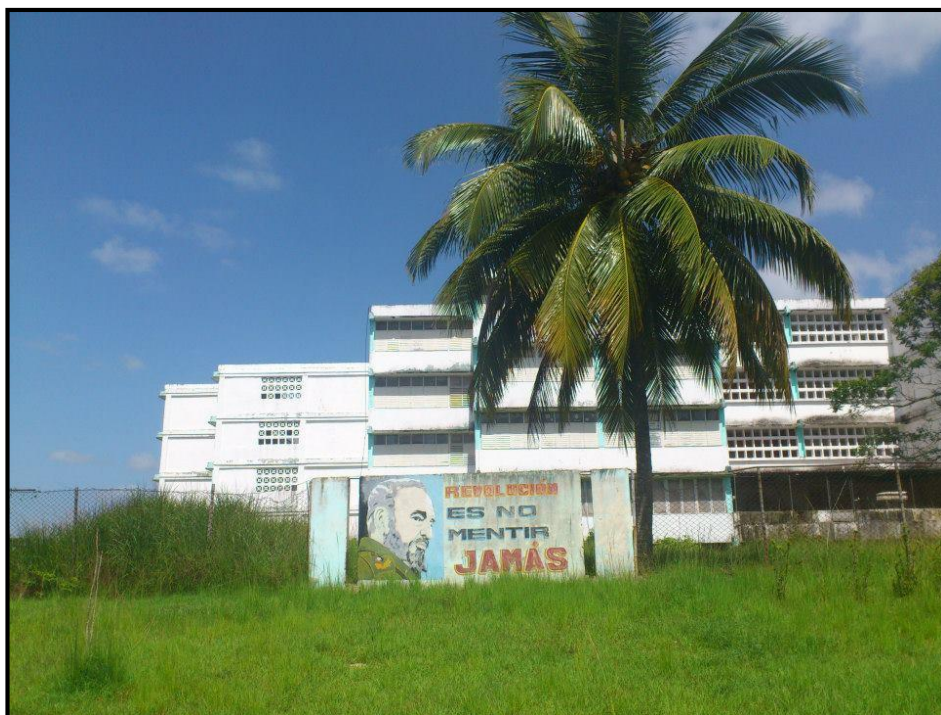
Façade of one of the student residences in Pinar del Río. The message by Fidel's image says "Revolution means never lying". Photo by the author (2013)